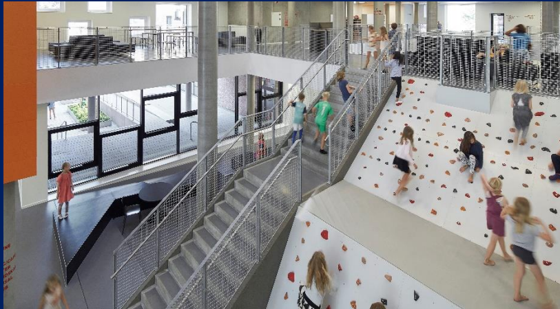
Frederiksbjerg School, Aarhus, Denmark. Designed by Henning Larsen

Dear colleague, 2021 has brought us another year of pandemic challenges. The A4LE European Leadership Team recognised that our range of workshops and Learning Spaces Live events could not continue as was planned. A